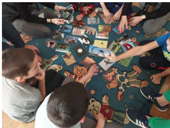
ACTIVITIES THAT SHOULD HELP CHILDREN THAT FLED THE WAR BETTER COPE WITH THE NEW ENVIRONMENT.

menting partner providing their counselling and assistance to people from Ukraine in all eight regions of Slovakia.