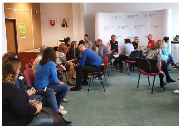
IOM TRAINING IN COUNTER-TRAFFICKING FOR INSPECTORS FROM LABOUR INSPECTORATE, HELD IN NITRA IN OCTOBER 2022.

The focus of trainings was given also to the topic of labour exploitation that may occur e.g. in the conditions of illegal work – that inspectors could meet in their work. They learnt about how victims of human trafficking might react in this environment, what to expect in this situation and what effects it might have on victims. Read more about IOM protection and capacity building .