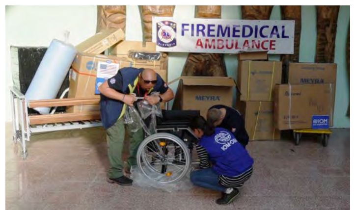
IOM MEDICAL AID DELIVERY TO THE GABCIKOVO ACCOMMODATION FACILITY IN OCTOBER 2022.

More than 90 elderly people are currently living in the facility. Most of them being dependent on assistance of health professionals, the aid delivery will make their everyday lives less difficult. →