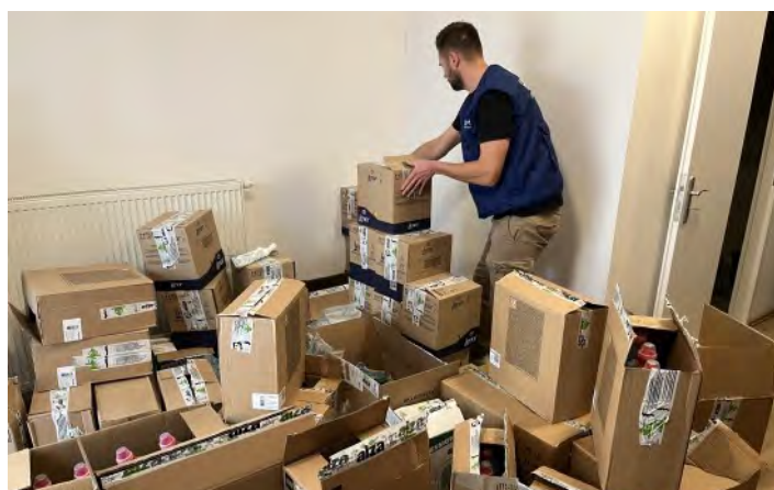
IOM HUMANITARIAN AID DELIVERY OF HYGIENIC ITEMS TO THE BUBO ASYLUM HOUSE AT SANCOVA STREET IN BRATISLAVA.

In June and August 2022, IOM delivered to the Bubo Asylum House at Dunajska Street in Bratislava other two batches of non-food humanitarian aid consisting mostly of hygienic and cleaning items.