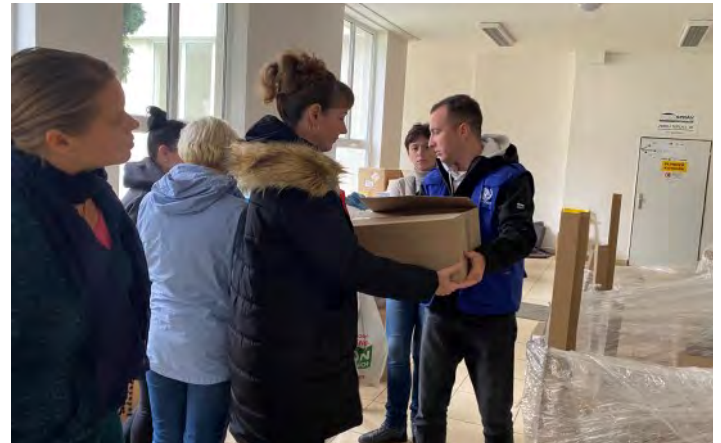
AN IOM CONSULTANT AT THE MICHALOVCE REGISTRATION CENTRE DISTRIBUTES HYGIENIC KITS FOR UKRAINIAN WOMEN WHO FLED THE WAR AND HAVE FOUND A SAFE REFUGE IN SLOVAKIA.

Source of data for the period of 24 February – 1 Nov. 2022: IOM , UNHCR , Ministry of Interior of the Slovak Republic.