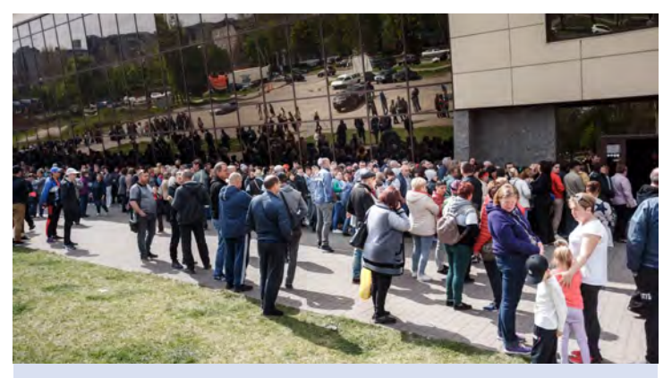
In Zaporizhzhia, people line up outside the Regional Humanitarian Hub to receive assistance from IOM.

In Ukraine , IOM was involved in providing support to the civilians evacuated from Mariupol to Zaporizhzhia through the United Nations and ICRC. On 2 May, IOM supported the UN operation through the provision of 1,600 mattresses, 1,600 blankets, 1,600 solar lamps, and 1,600 family hygiene kits, for distribution to the evacuated civilians in Zaporizhzhia. Needs remain in terms of hygiene supplies and support to collective centres, but also for cash-based interventions and protection.