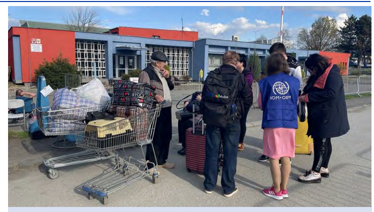
IOM Staff provide assistance and legal counselling to people fleeing war in Ukraine at Vyšné Nemecké BCP.

In Poland, IOM continues to assist conflict-affected persons with PESEL (Universal Electronic System for Registration of the Population) assistance at the National Stadium in Warsaw. Alongside support with filling out applications, IOM also provides information on IOM Poland's available services and distributes "Be Safe" leaflets on safe migration. The most common types of cases in May included: unaccompanied minors; persons without shelter; persons in need of psychological aid; persons excluded from services that should be available to them; and persons that are not eligible for a PESEL number. This month, IOM provided support to 6,279 persons, including 4,454 women and 1,398 men (4,226 adults and 2,010 children). Among these, 90 cases included persons with disabilities. Overall, 5,659 persons assisted were Ukrainian refugees and 95 persons were TCNs.