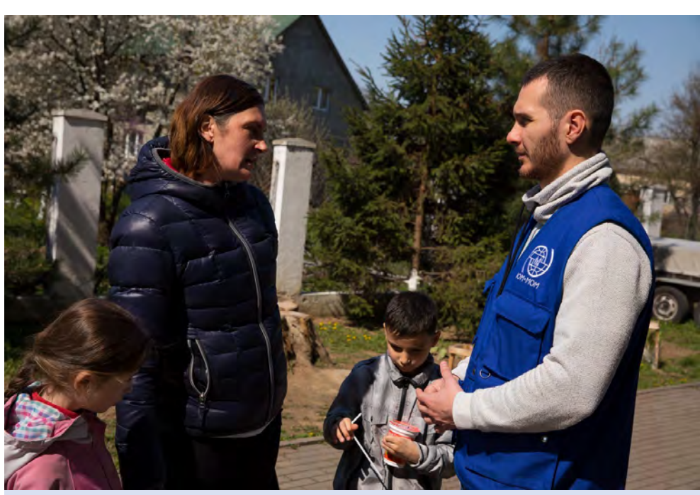
IOM staff discusses cash-based interventions with a conflict-affected family in Ukraine's Zakarpattia Region.