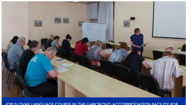
IOM SLOVAK LANGUAGE COURSE IN THE GABCIKOVO ACCOMMODATION FACILITY FOR PEOPLE FROM UKRAINE.

For those fleeing war in Ukraine and arriving to Slovakia, knowledge of Slovak language facilitates their communication with Slovak authorities, increases their opportunity to find a job corresponding to their job experience and skills, and helps them to find friends among Slovaks as well.