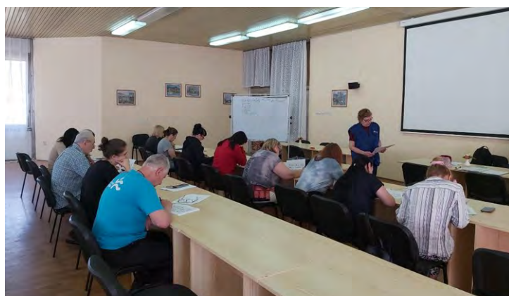
IOM provides Slovak language courses for displaced persons staying in the Gabčíkovo accommodation facility.

In Slovakia , IOM continues to support the government with information provision to displaced persons in the Gabčíkovo accommodation facility on legal matters, including the national legal framework for the protection of vulnerable cases, access to social welfare benefits, and employment pathways. IOM has also launched Slovak language courses for those staying at the site and prepared the first Prevention of Sexual Exploitation and Abuse (PSEA) information sessions for young people.