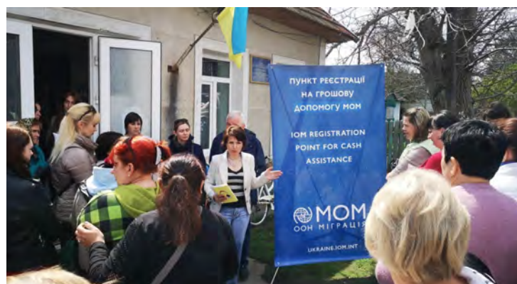
IOM continues registration for and distribution of cash assistance in Zakarpattia, Chernivtsi, Ivano-Frankivsk, and Vinnytsia.

In Ukraine , IOM continues to provide support to conflict-affected persons to meet their immediate basic needs through multi-purpose cash assistance (MPCA). As of 10 May, the mission has assisted 64,000 displaced persons and further registration is underway, in coordination with local authorities.