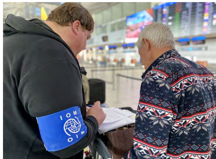
IOM Hungary assists third country nationals during transit back to their countries of origin.

as direct assistance before and during departure. During the reporting week, 22 third country nationals received counselling.