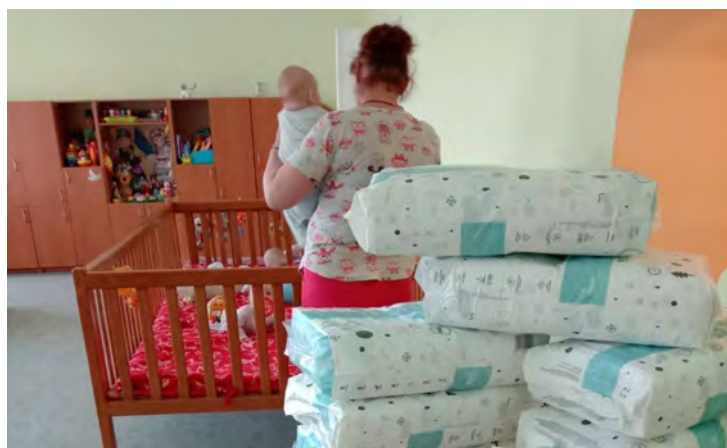
IOM distributes baby kits with necessary items to persons in Ukraine.

In Ukraine , during the reporting period, IOM distributed 200 external fixators totalling USD 20,000 to hospitals in Mykolaiv and Chernihiv to treat bone fractures. Since the start of the crisis, over 316,000 non-food items have reached or are set to be distributed to beneficiaries in 20 different oblasts. Alongside NFI distributions, the mission is scaling up shelter assistance. Two mobile shelter teams have been deployed in Uzhhorod, (Zakarpattia region) and are conducting light and small-scale repairs to collective centres. This approach will be replicated in Vinnytsia, Lviv and Ivano-Frankivsk regions.