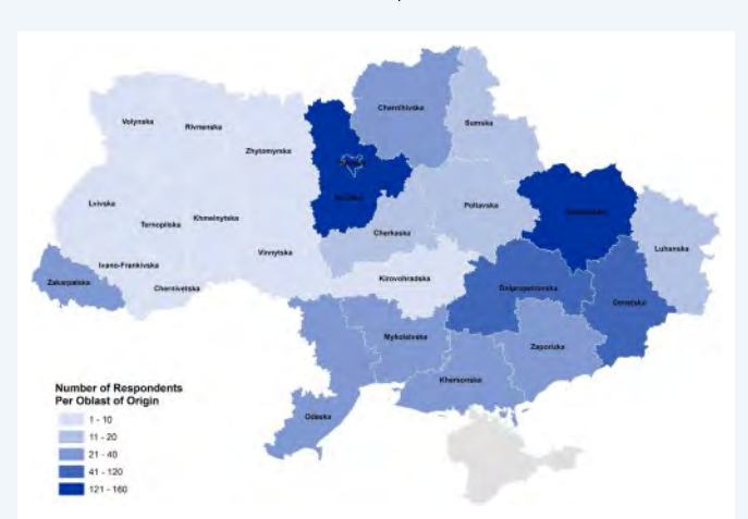
Regions of origin or habitual residence — Ukrainian refugees and TCNs

IOM Slovakia published its <u>third rapid needs and intentions</u> <u>assessment report</u> based on 780 face-to-face surveys with Ukrainian refugees (99 %) and third-country nationals (TCNs). IOM's Displacement Tracking Matrix (DTM) team in Slovakia collected data at the border crossing points and reception centers between 9 March and 22 May 2022.