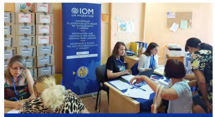
IOM CONSULTANTS PROVIDING COUNSELLING AT THE GABCIKOVO ACCOMMODATION

In July, the information that people needed the most was related to the Slovak language courses, labour counselling and employment contracts. Residents of the Gabcikovo facility are eager to work and safe employment is their first step in the integration and taking a new life direction.