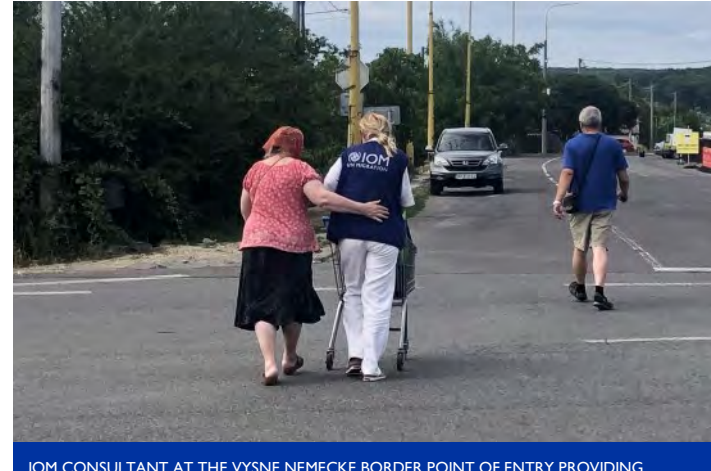
IOM CONSULTANT AT THE VYSNE NEMECKE BORDER POINT OF ENTRY PROVIDING COUNSELLING ON TRANSPORT AND TEMPORARY SHELTER IN SLOVAKIA TO A MOTHER WITH HER DAUGHTER FROM KHARKIV.

Source of data for the period of 24 February – 2 August 2022: <u>IOM</u>, <u>UNHCR</u>, Ministry of Interior of the Slovak Republic