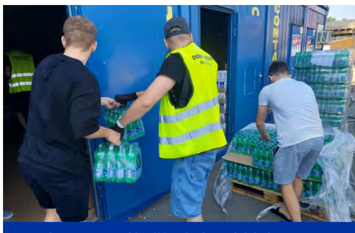
DELIVERY OF HUMANITARIAN FOOD ASSISTANCE TO THE HOTSPOT CERVENA HVIEZDA IN KOSICE IN JULY 2022.

In the course of one month, this first contact centre helps people in need after a long journey often in high temperatures and gives them out 14,000 bottles of water, 2,800 baby food pouches or 1,600 teas. IOM will deliver another shipment to the Kosice hotspot consisting of food items for further 2 weeks consumption.