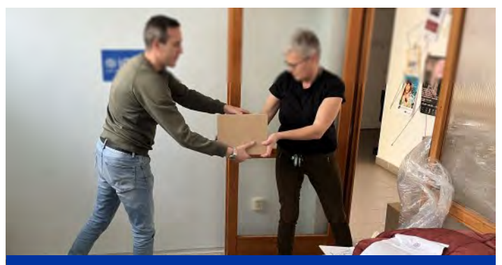
IOM HUMANITARIAN AID DELIVERY TO THE CULTURAL CENTRE AKTIVITY IN TRENCIN IN NOVEMBER 2022.

Since the beginning of the war in Ukraine, IOM has been delivering humanitarian aid to various towns in Slovakia to help people from Ukraine who found a temporary refuge there.