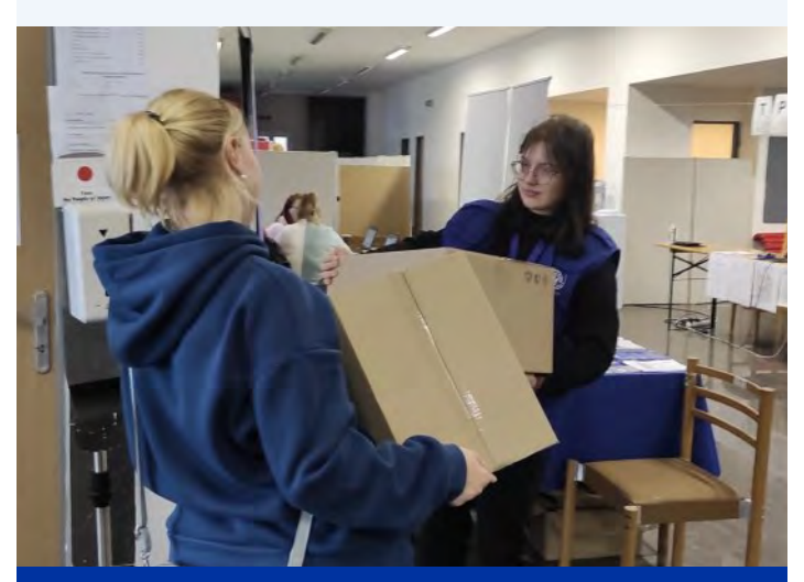
THIS WOMAN ARRIVED WITH HER CHILD WITH A DISABILITY AND AN ELDERLY MOTHER FROM KYIV TO SLOVAKIA. SHE WAS LOST AND CONFUSED AND TURNED TO AN IOM FRONTLINE TEAM AT THE MICHALOVCE REGISTRATION CENTRE FOR HELP AND SHE RECEIVED DETAILED INFORMATION ASSISTANCE ON HER OPPORTUNITIES IN SLOVAKIA AND HYGIENIC KITS FOR HER FAMILY.

Direct assistance and response to immediate refugee needs at border points of entry and dedicated registration centres.