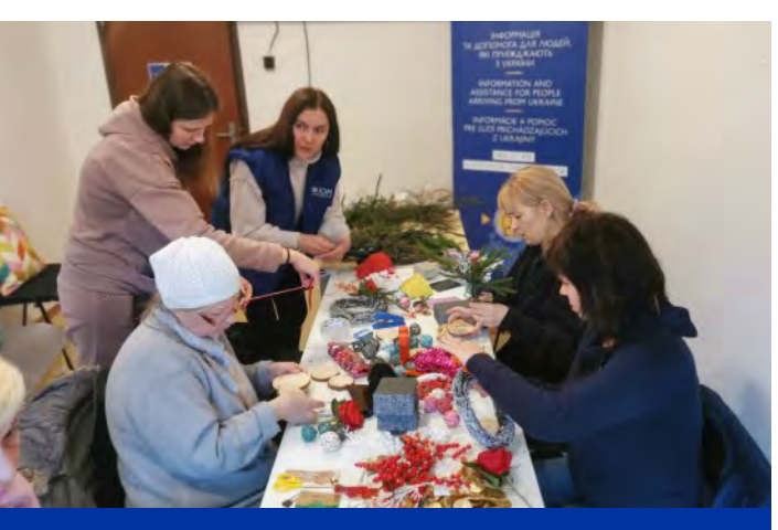
IOM CREATIVE HANDICRAFT WORKSHOP FOR WOMEN FROM UKRAINE AT THE GABCIKOVO ACCOMMODATION FACILITY IN DECEMBER 2022.

Women created ikebanas, table and room decorations and wreaths. Some of the products will be available at a community Xmas market in the facility.